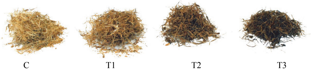
Figure 1. Treated raw materials

A custom-made labor chamber was used for the treatment. Since the chamber interior is not airtight from the outside, steam escapes from the system during the treatment and oxygen is present. The system is an open and dry system. The bark chips were heated from room temperature to 95 °C in one hour, from 95 °C to 130 °C in another two hours, and then to the peak temperature of 180 °C top in another 30 minutes. Three different treatment durations (constant temperature) were used which lasted one (T1), two (T2) and three (T3) hours ( Figure 1 ). During cooling, the thermal inertia of the chamber was exploited; hence, the specimens were cooled to 25 °C in about 15 hours. Three panels were produced from each type.