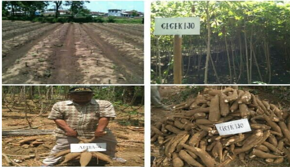
Figure 2. The performance of cassava plants and fresh tubers in Sukowilangun village, Kalipare sub-district, Malang district, East Java province, Indonesia, 2013

In the present study, the high fertilizer dose of 225 kg N + 108 kg P 2 O 5 + 180 kg K 2 O + 5 t of manure yielded 83.33 t/ha which was 7% lower than the medium dose of 112.5 kg N + 108 kg P 2 O 5 + 120 kg K 2 O which yielded 89.22 t/ha (Table 3). The performance of cassava plants and fresh tubers is presented in Figure 2.