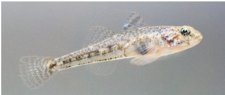
Fig. 1. Knipowitschia caucasica (♂, total length 32.5 mm) sampled in the Serbian section of the River Tisa

At the end of the first dorsal fin of the males there is a dark spot, sometimes showing yellowish or bluish colouring. There are dark transversal stripes on the dorsal fins visible also on living specimens. Their number is mainly 3-4 on the first dorsal fin, while it varies 3 to 5 on the second one. There can be identified at least five transversal rows of spots on the caudal fin. The pectoral fin, the pelvic disc and anal fin are weakly pigmented on the males but not pigmented on the females. The ventral side of the males is gray from the top of the lower jaw to the first membrane of the pelvic disc, while in females only the top part of the lower jaw is pigmented. In living females when full of eggs the pectoral region and part of the ventral region show orange colouring but it disappears during conservation. The posterior edge of the operculum in the side of the throat is of silver colouring on both sexes. Generally this spot on males is larger and also the region of the pectoral fins may show similar glistening.