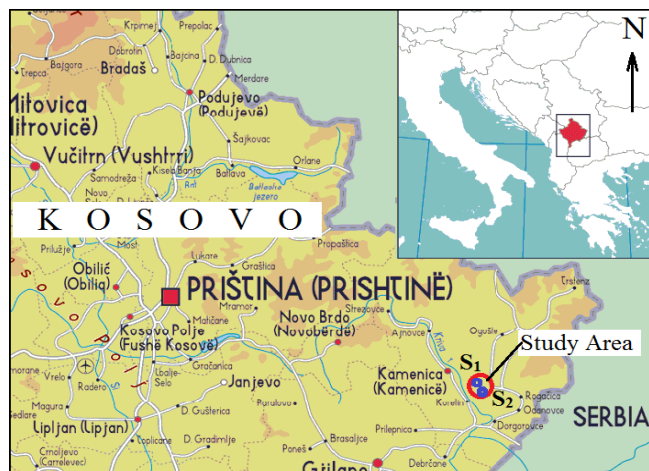
Figure 1. Location of the study area and positions of sampling stations.

pollution sources. The levels of some physico-chemical parameters of well waters are compared with the World Health Organization standards for drinking water. 35,36 Finally some parameters of the present sample were compared with values of 3 well-waters in Kosovo.