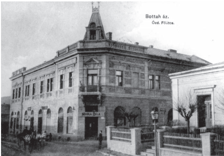
Picture 3: View of the high street of Ózd

Even the contents of newspapers reflected the town-like features of Ózd at the turn of the century. In the January of 1910 a local paper called “Ózdi Hírlap” described Ózd this way: ‘For only a few years our little village has been undergoing a drastic change. Certain things happen day by day and they further the formation of a small country town from a muddy settlement. Delightful palaces are being built (...), and the society is slowly beginning to be a town...’ (Alig néhány. Ózdi Hírlap, 9. jan. 1910. 9. p. 2) Not only the journalists had these thoughts but also the local intellectuals whose real aim was also the change from village to town already in this period. Göbl Márton local parish priest had also expressed his thoughts in the paper called “Ózd és Vidéke” in 1907, more than 40 years before Ózd was pronounced town. He suggested that by joining the neighboring settlements to Ózd ‘... it will found a large town. These settlements are so closely located to the developing industry of Ózd which provides them, that their joining involuntarily offers itself and it can lead to the formation of a town with a regular council.’ (Dr. Göbl Márton: Ózd jövője ( The future of Ózd ). In: Ózd és Vidéke, Dec. 5. 1907. pp 2–3). These words unequivocally refer to the fact that contemporary intellectuals all believed that both the aesthetic and social image of Ózd showed that the settlement would soon have to be given the status of a town.