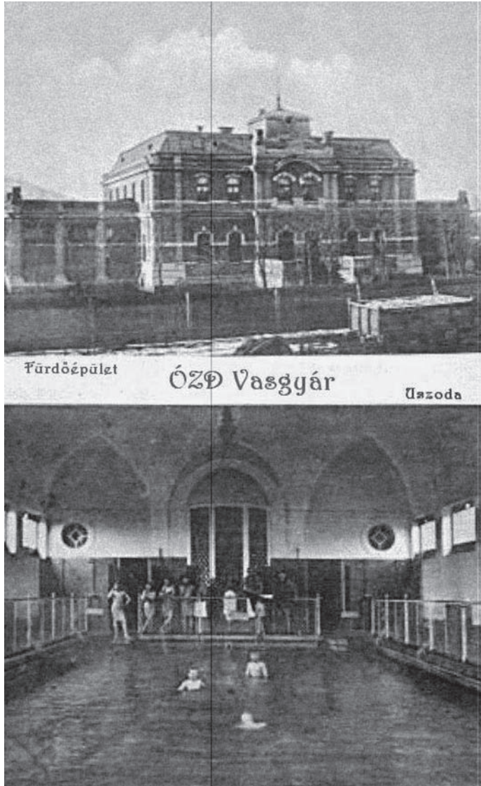
Picture 2: The building of the indoor swimming pool and bath in Ózd

were of great architectural value. These are unambiguously the signs of urbanization since Ózd was adequately provided with public institutes already in the late nineteenth century. (Nagy 2012)