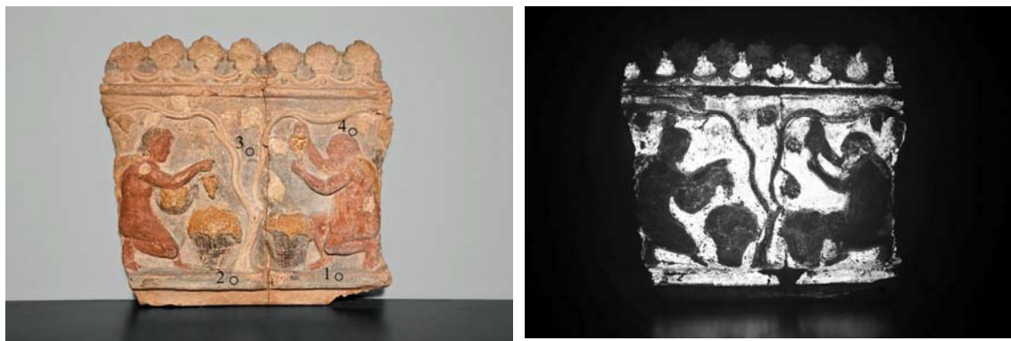
Fig. 1.: left, Color photograph of the Campana relief, NCG inv.no. IN 1708 (32 × 35 cm), with sampling spots 1 to 4 indicated by black circles; right, VIL image of artefact IN 1708 with the typical fluorescence of Egyptian blue .

1. ábra: balra, A Campana relief színes fényképe, NCG ltsz. IN 1708 (32 × 35 cm), a mintavételi pontokat 1-től 4-ig fekete körök jelölik; jobbra, a tárgy (ltsz: IN 1708) fotolumineszcens (VIL) felvétele, ami az egyiptomi kék festék jellegzetes fluoreszcenciáját mutatja.