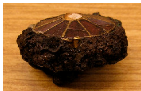
Figure 2a and 2b. Photo of the disc fibula with almandine inlays, from the collection of the Hungarian National Museum (origin: Kölked, Hungary; 2 nd half of 6 th c. AD, Grave A 279; 76.1.45). This object became the logo of the Ancient Charm project.

Fig 2a: front view, Fig 2b: lateral view.