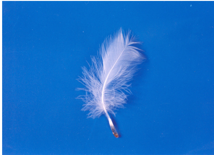
Figure 1: Below the ripe feather developing new feather throws out the old feather, the nutriment supply shall be stopped, and the feather is necrotizing and falling out

During the moulting period the nutriment supply of the old feathers will be stopped, they are situated loosely in their capsules, so the ripe feathers can be removed free from pain and skin injury ( Schneider, 1995 ). The extraction will be facilitated by the fact, that the poultry skin is less sensible than the mammalian one ( Schwarze and Schröder, 1979 ).